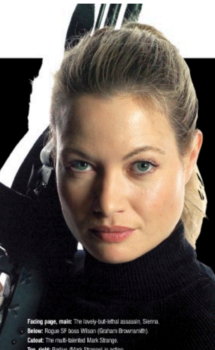
Facing page, main: The lovely-but-lethal assassin, Sienna.